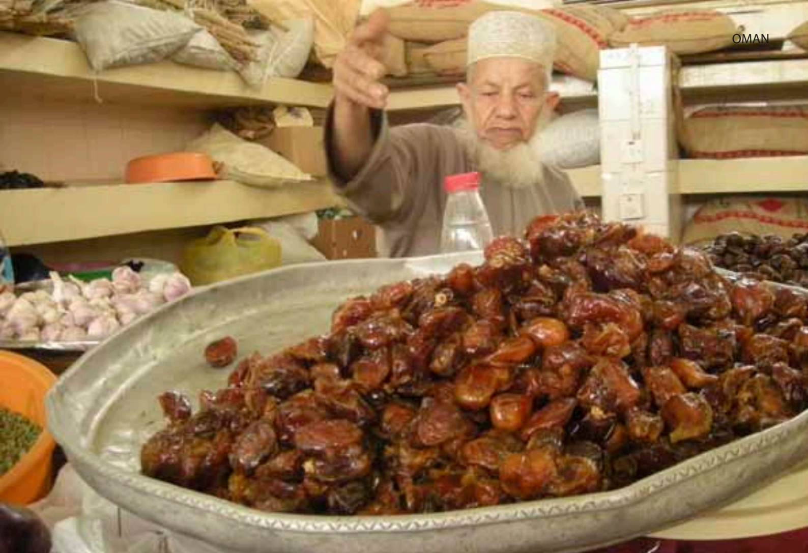
Dates on sale at the vegetable market in Mutrah