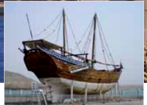
Dhow building is still a thriving occupation in Sur, Oman

One of the 'must dos' from Sur is to take the short drive to the ancient city of Qalhat. Even the 'new' centre feels like something out of medieval times, with its narrow streets and traditional housing.