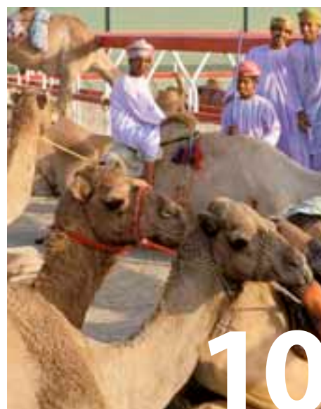
At the Nizwa cattle market

This Oman supplement has been produced and distributed by TRAVELinc Magazine. Phone 0064 9 818 7807 www.travelinc.co.nz The supplement was sponsored by Oman Tourism, which distributed extra copies and assisted with ground arrangements. Thanks to Etihad Airways, Shangri-La's Barr Al Jissah Resort & Spa, Al Bustan Palace InterContinental, Desert Nights Camp, and Eihab Travels.