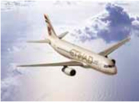
Etihad provides a convenient way to reach Muscat

Etihaad code shares with Qantas across the Tasman, Auckland to Sydney and the fare structure allows the use of the EY or JQ/QF flight number from Auckland, Wellington or Christchurch. The EY fares are common rated to Muscat from Auckland, Wellington, or Christchurch. The fares allow travel via Sydney, Melbourne or Brisbane to give the best connections.