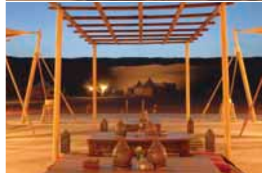
Desert Nights Camp Lobby and the dunes at night