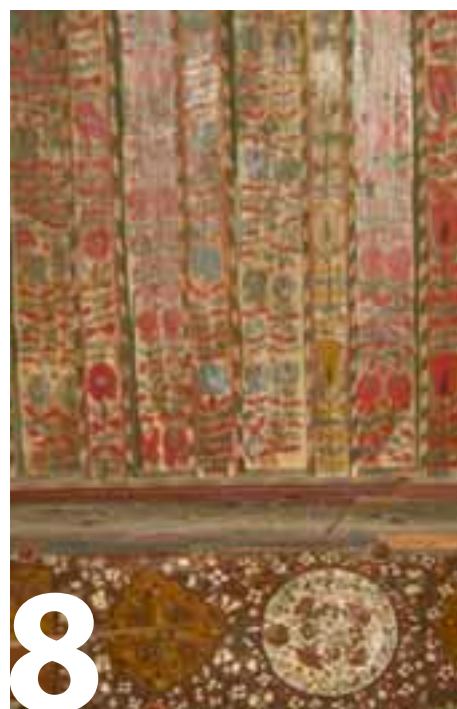
A ceiling at Jabrin Castle