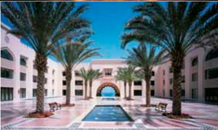
The Al Husn Hotel's entrance (top) and courtyard