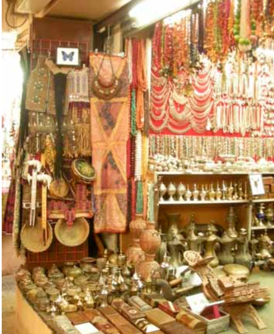
A shop in the famous Mutrah Souk

The main entrance to Mutrah Souk is on Mutrah Corniche, the harbour area and if a visitor ever gets lost in the rambling alleyways (of which there are many) they just need to ask shop owners or other locals to point in the