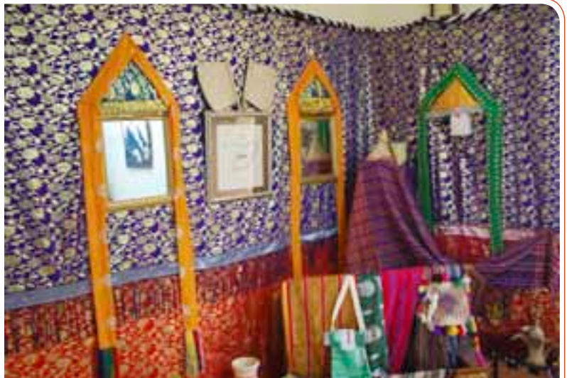
A selection of product at Sidab Women's Sewing Group