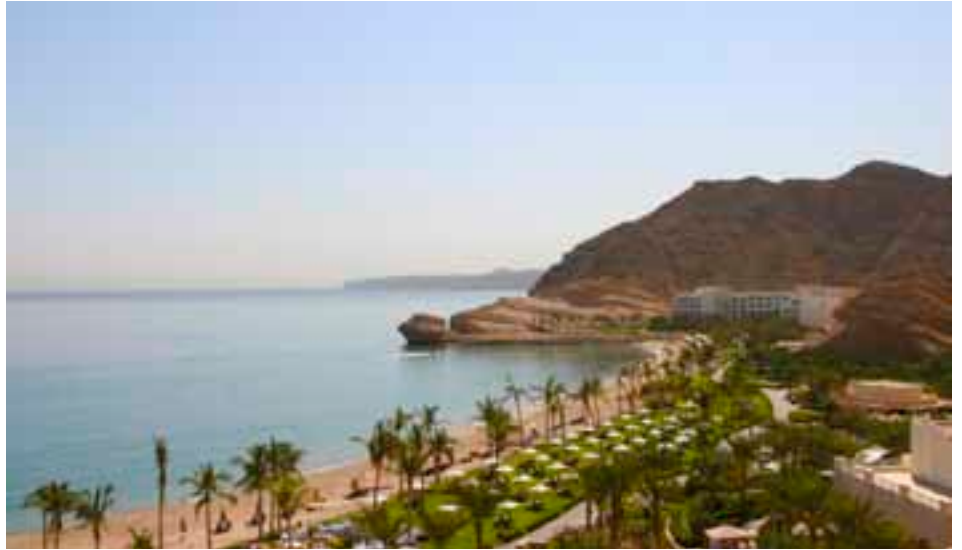
The lawn and beach area at Shangri-La's Barr Al Jissah Resort & Spa

She says Barr Al Jissah is a regular at the AsiaPacific Incentives and Meetings Expo (AIME) in Melbourne and took part in an Oman Ministry of Tourism roadshow this year to both Australia and New Zealand. 'Etihad flies from Australia and Emirates flies from Australia and New Zealand, so that all helps. We have a few leisure groups from Australia here and we had an incentive from there last year.'