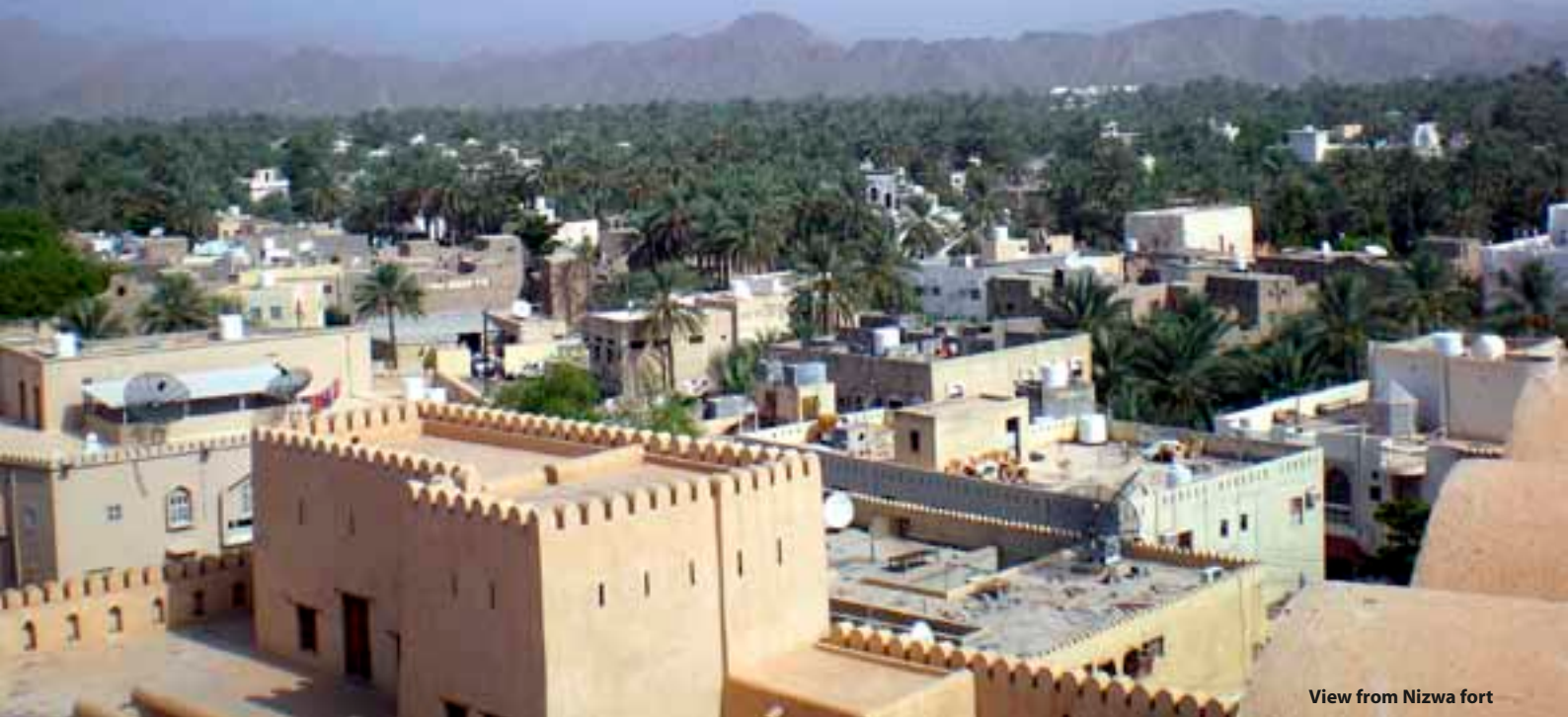
View from Nizwa fort