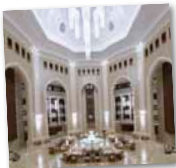
Al Bustan Palace InterContinental