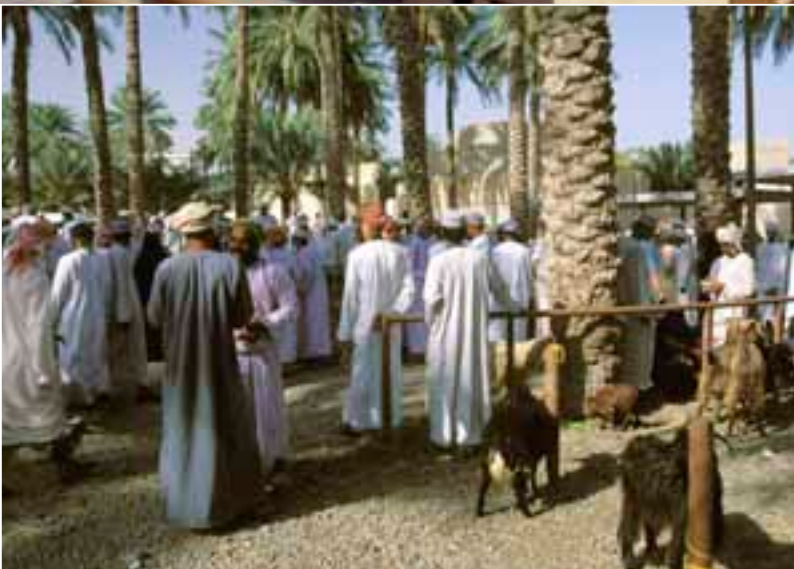
Nizwa goat markets