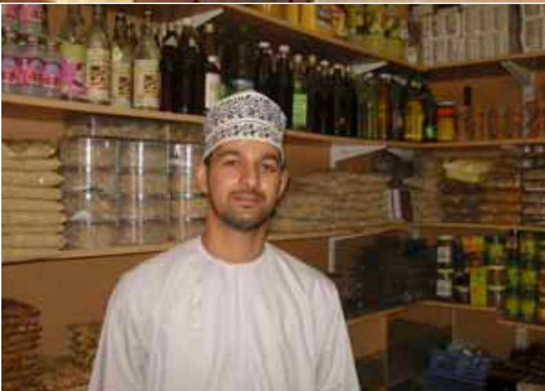
Sultan's Saffron and other spices can be purchased from Ishaq