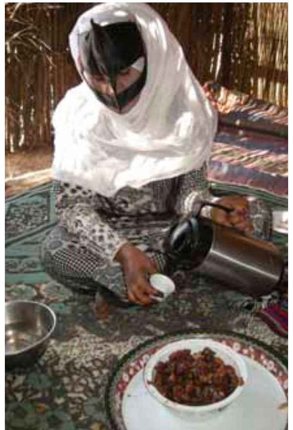
Houses may have replaced tents in many cases, but Bedouin tradition lives on in Oman

It is important to always give with the right hand and take with the right hand. When finished, shake the cup and hand it back to the host.