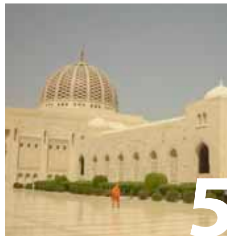
The Sultan Qaboos Grand Mosque