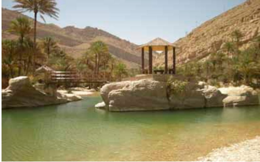
Wadi Bani Khalid

In recent times, a small café – restaurant,