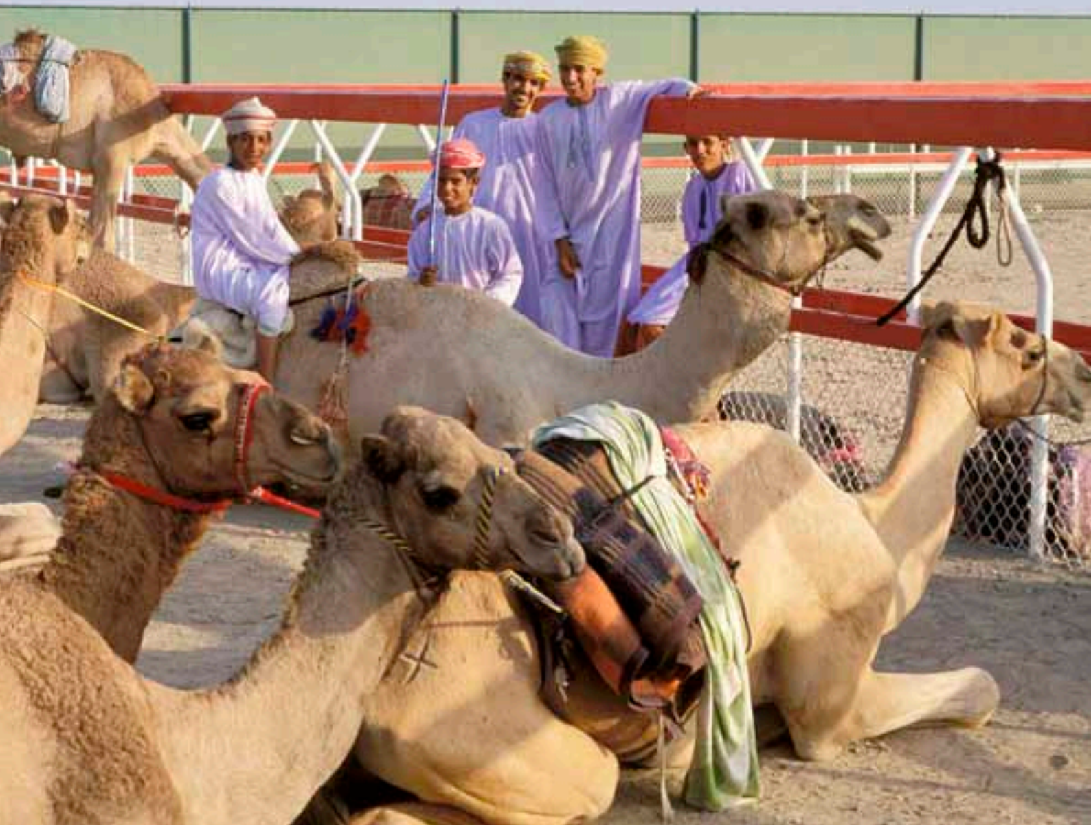
Nizwa cattle markets